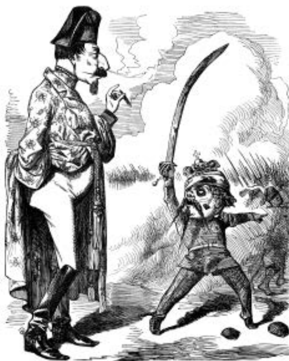
THE GIANT AND THE DWARF.

A cartoon published in Britain in June 1859. Napoleon III, on the left, is saying to King Victor Emmanuel, 'Bravo, my little fellow! You shall do all the fighting and we'll divide the glory.'