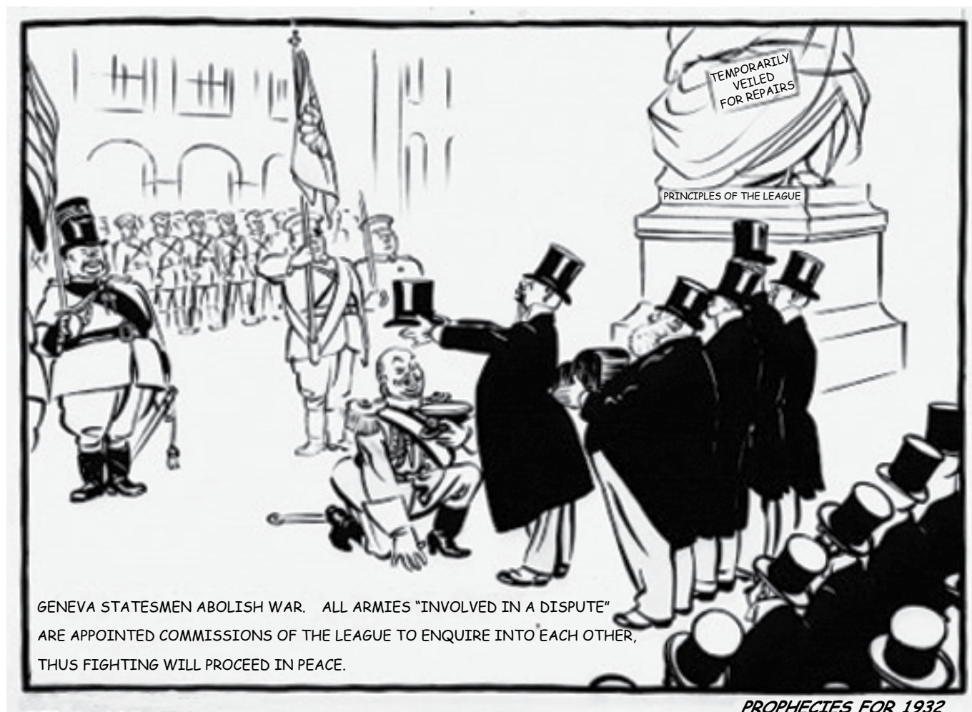
A British cartoon published in December 1931.